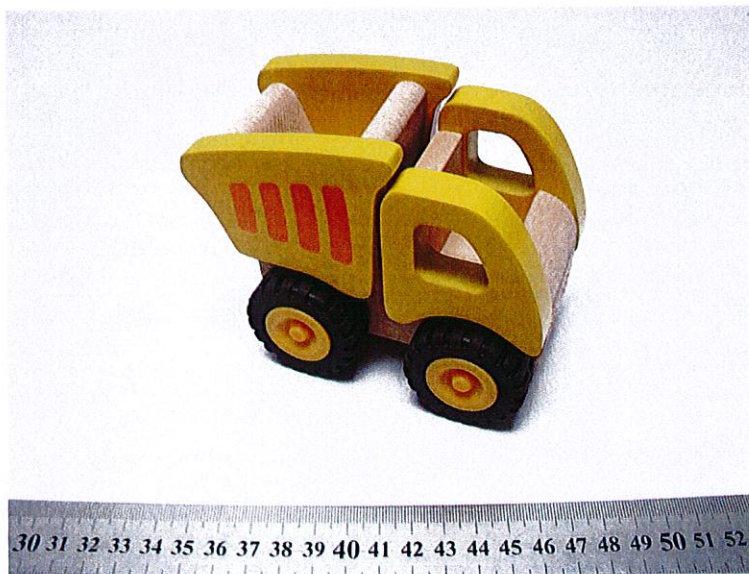
Photo of the sample